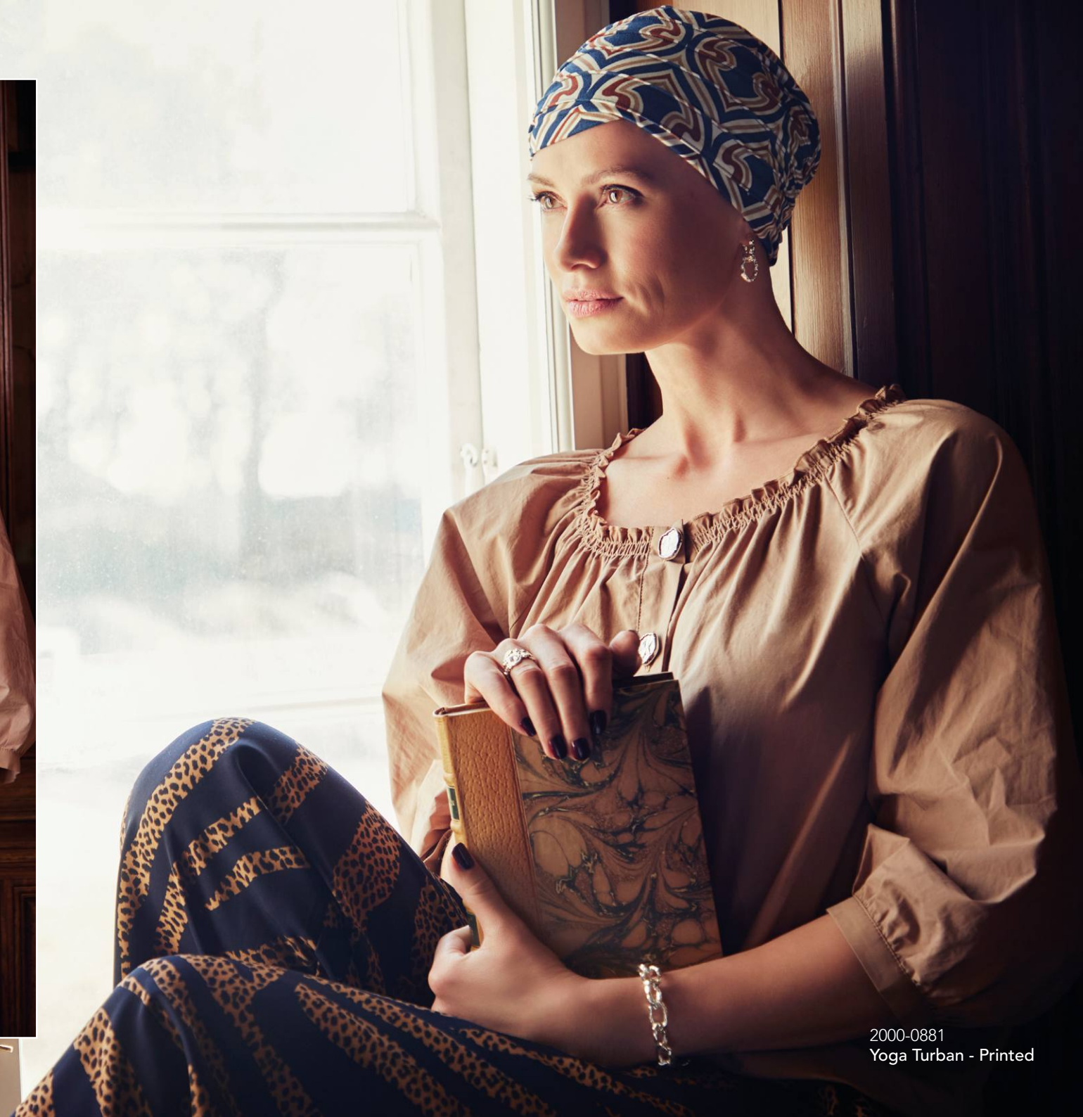
2000-0881 Yoga Turban - Printed