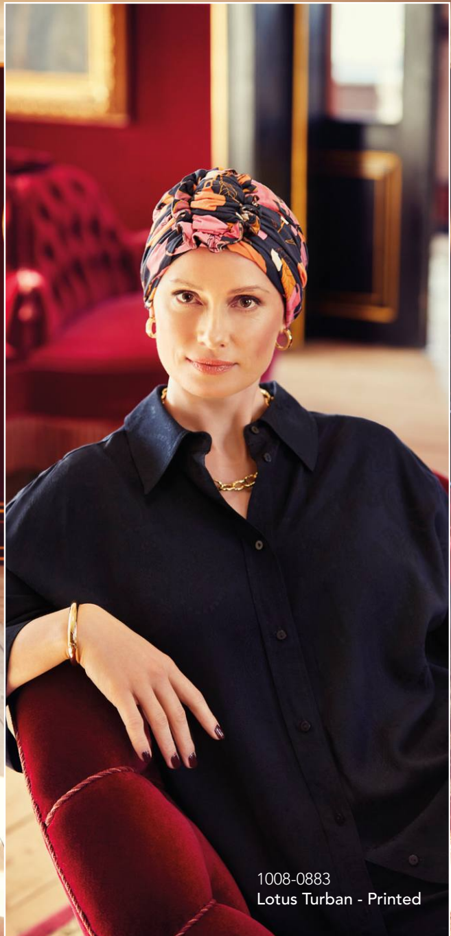
1008-0883 Lotus Turban - Printed