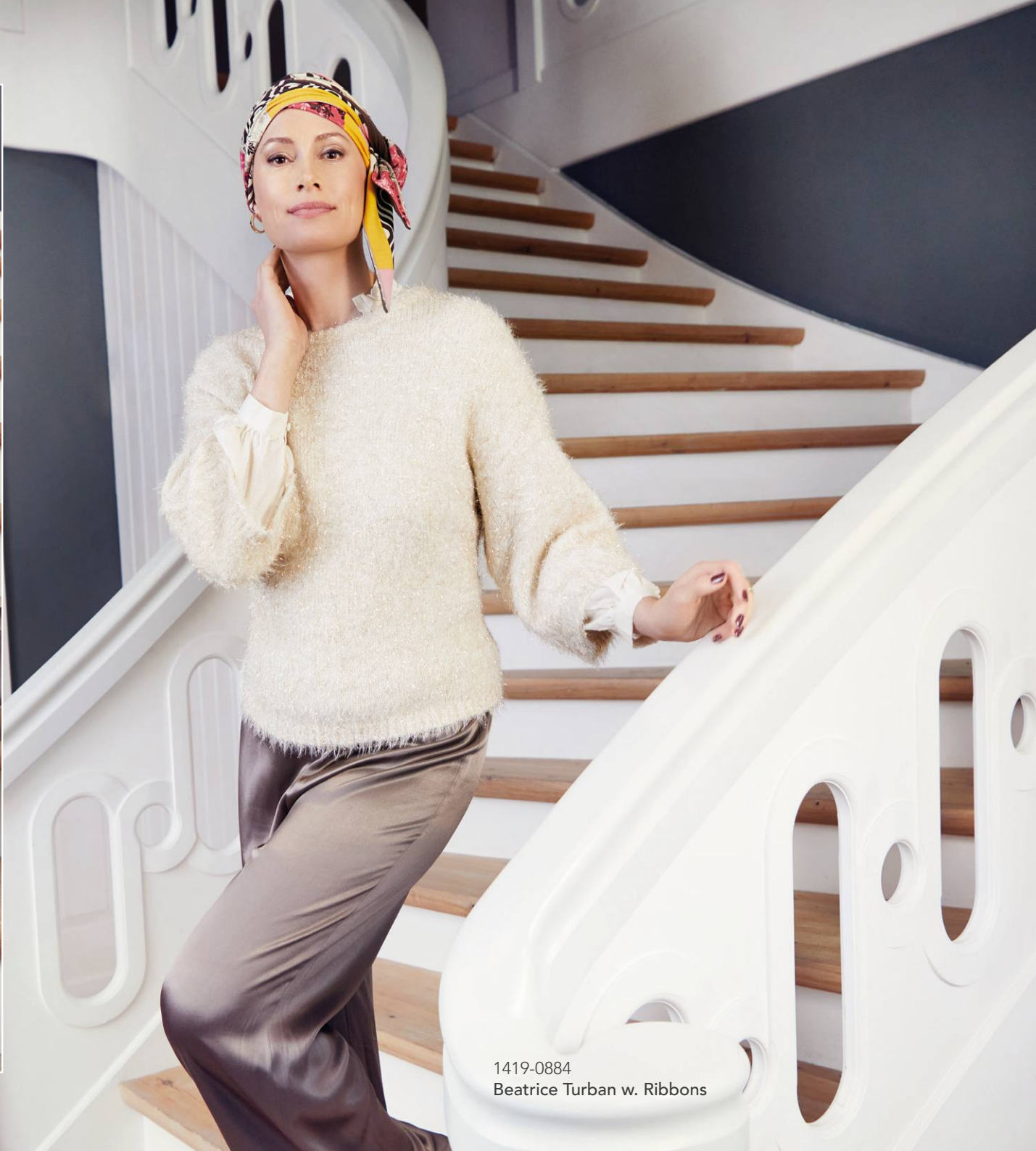
1419-0884 Beatrice Turban w. Ribbons