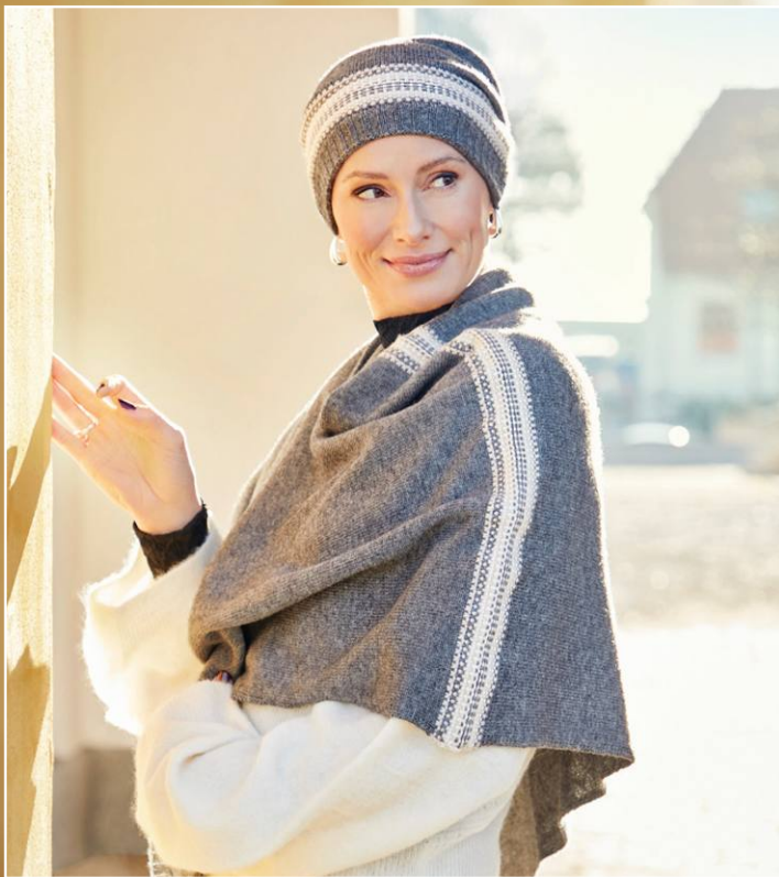
1548-0906 & 1547-0906 Christine Poncho & Hazel Knitted Hat