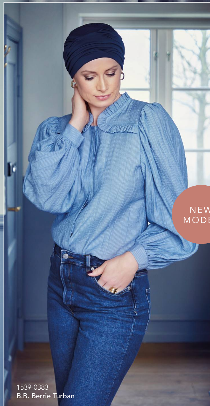
1539-0383 B.B. Berrie Turban