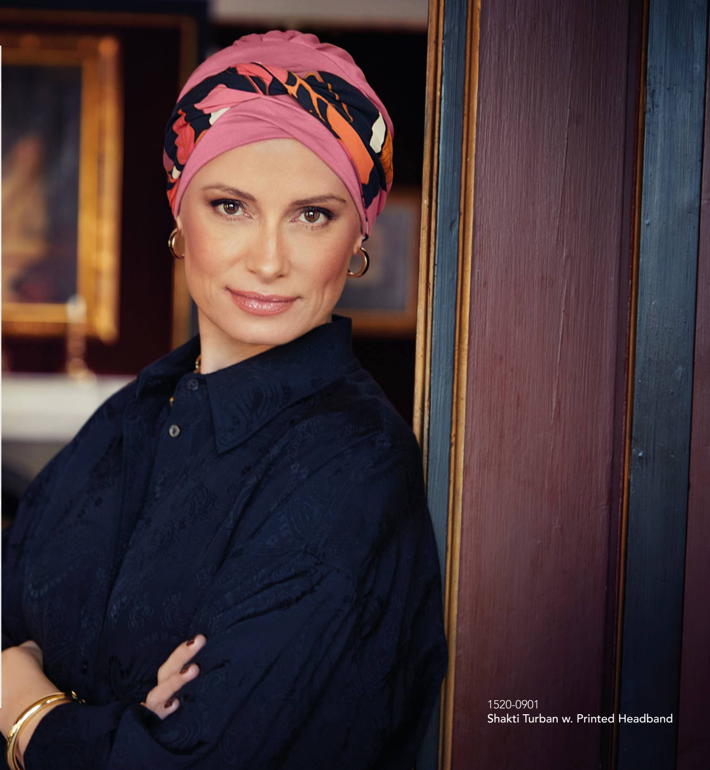
1520-0901 Shakti Turban w. Printed Headband