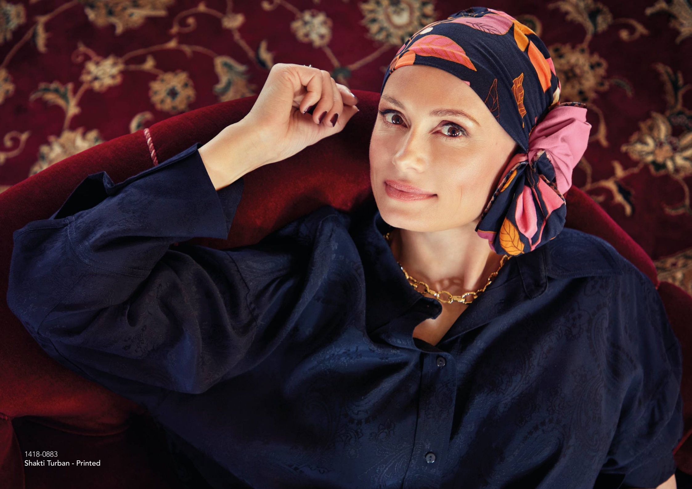
1418-0883 Shakti Turban - Printed