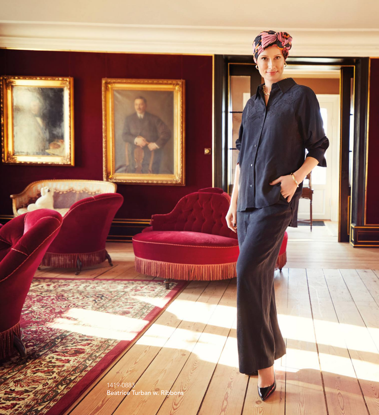
1419-0883 Beatrice Turban w. Ribbons