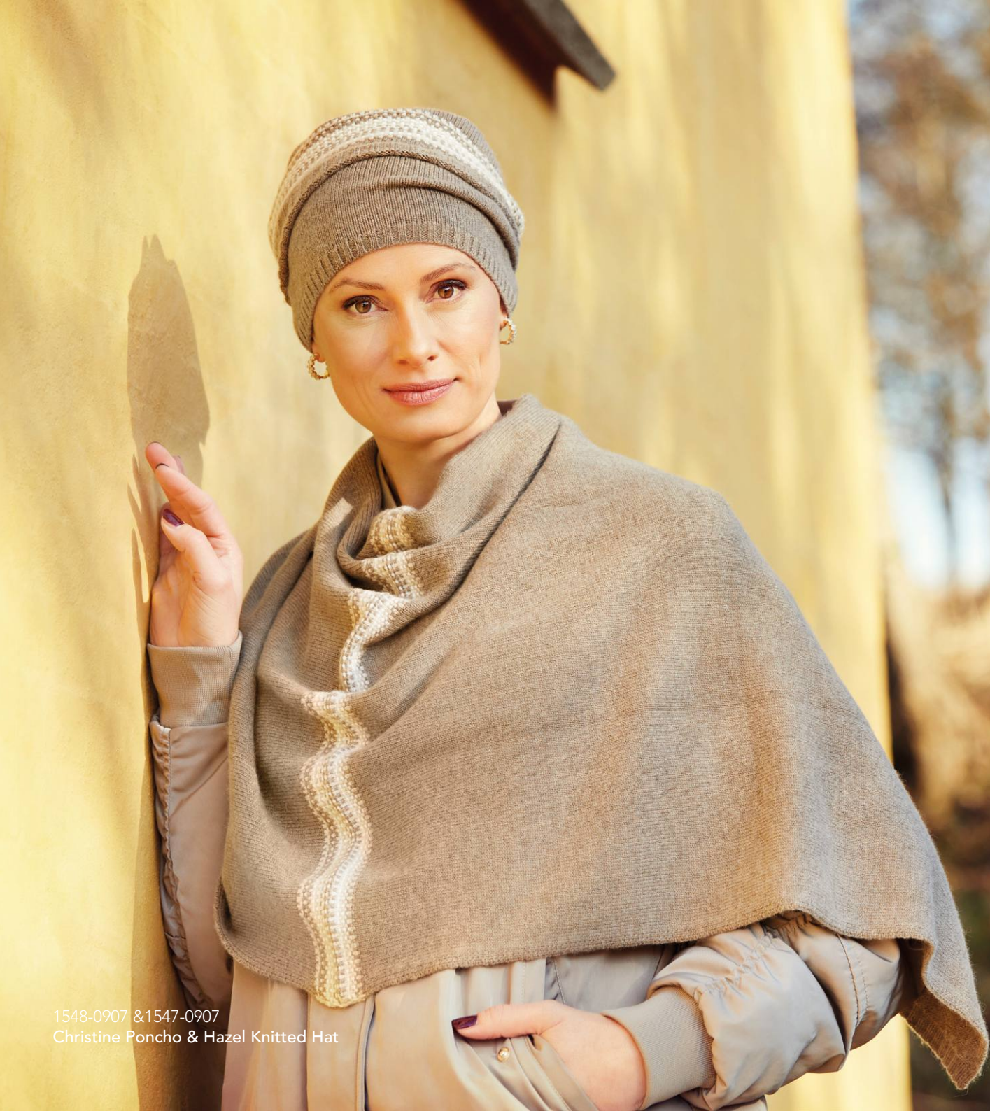
1548-0907 & 1547-0907 Christine Poncho & Hazel Knitted Hat