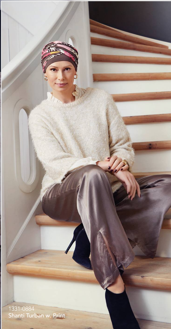
1331-0884 Shanti Turban w. Print